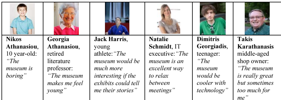
Table 1. Visitor personas at the AM.

For the Acropolis Museum we created five visitor personas (Table1):