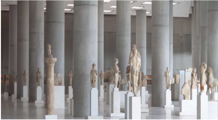
Figure 1. The Archaic Gallery

At the Acropolis Museum, the CHES project focuses on the Archaic Gallery (figure 1), which is located on the first floor. Here, visitors can wander amongst the architectural and sculptural remains of the period spanning from the 7 th century B.C. to the Persian Wars (480/79 BC). The flexibility of its design, as well as the diversity of historical facts and approaches behind the objects, makes the Archaic Gallery the perfect context to develop the CHES project.