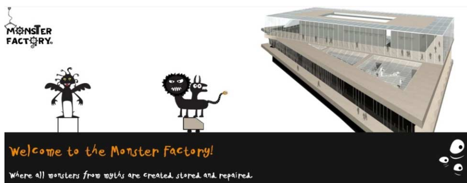
Figure 2. The Monster Factory Game

Stories are commonly considered to have a narrative form, containing a set of smaller story pieces which are typically placed into a static order by the author, so as to communicate one or more messages to the end user/audience. Depending on the type of the story (and the author's will), the ordering of the smaller story pieces may be strict, allowing for no other orderings, or flexible, enabling the production of alternative orderings of the same story pieces, which all convey the same message(s).